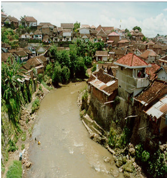
Typical Riverside Low Income Community

Malang, like most medium-sized cities located in the hilly areas of Java, has fairly deep river valleys dividing the urban area. Most of the older parts of the city have been built on ridgelines; the newer parts, especially lower income areas, are spread along the river valleys where land is "available". In general, riverside locations make disposal of human waste physically easier than on the ridges, but not necessarily healthier or more environmentally responsible. 3