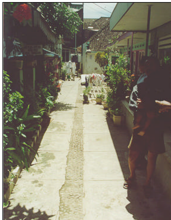
Tlogomas: Main pipeline laid in lane.