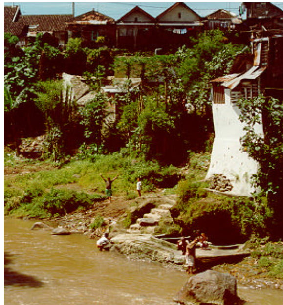
Brantas River - multiple uses: bathing, washing, and open-air toilet