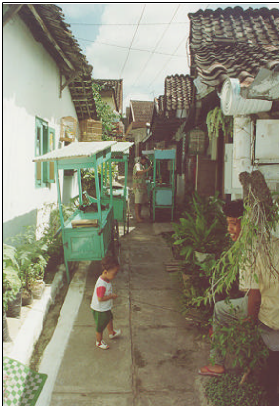
Malang - Congested housing in a poorer neighborhood